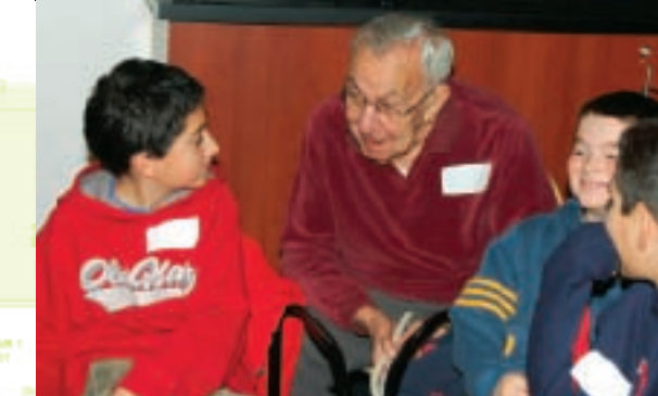
Rashi students and Hebrew SeniorLife residents enjoyed getting together for a book discussion.