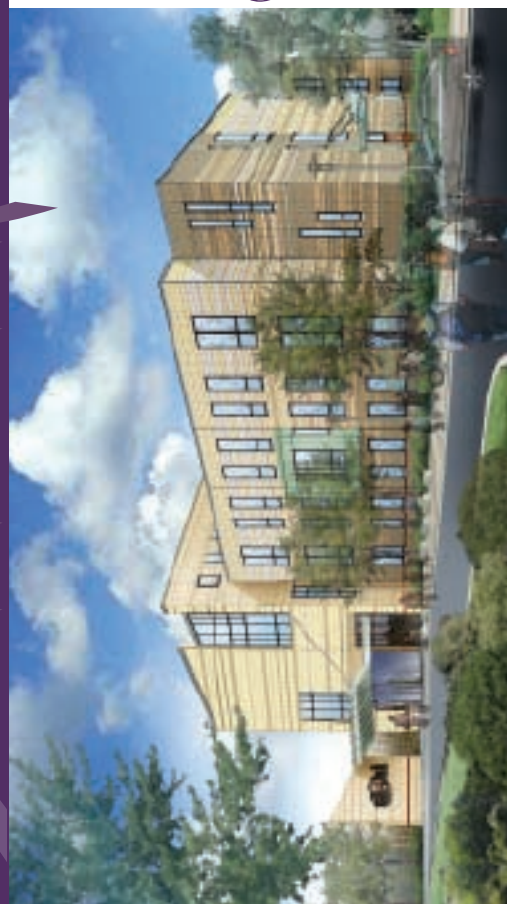
NEW RASHI SCHOOL TO OPEN IN 2010