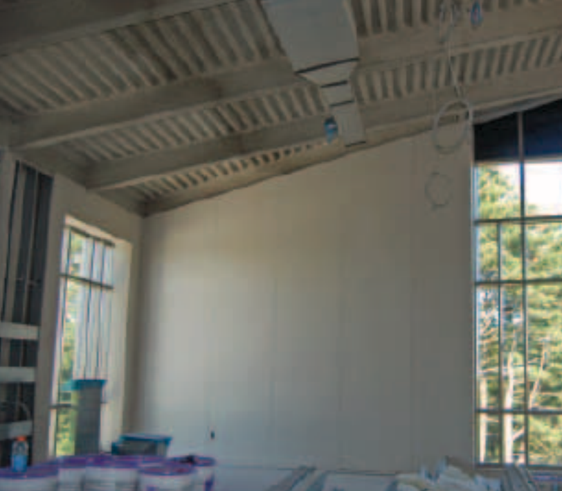
Above: The Middle School science room on the top floor of the new building features large windows and a high sloped ceiling.