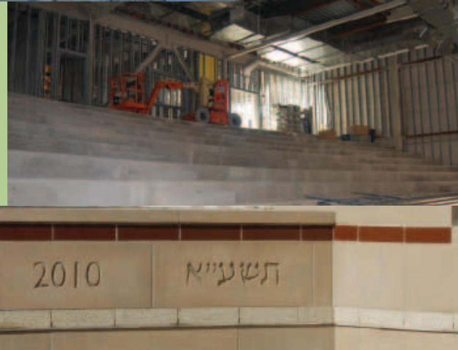
Below: The cornerstone is now in place at the main entrance.