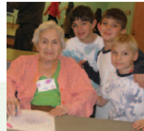
Rashi's Mitzvah Makers program has been forging relationships between students and HSL residents for 14 years. Plans are in the works for ongoing programs with the residents of NewBridge on the Charles in the year leading up to the move to the new campus.