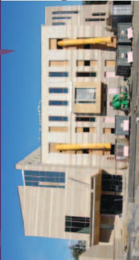
NEW RASHI SCHOOL TO OPEN IN 2010